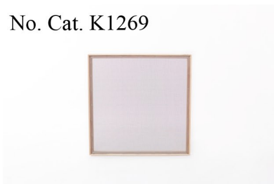
Pollen dryer drawer wooden frame