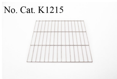
Inox shelf for honey jars