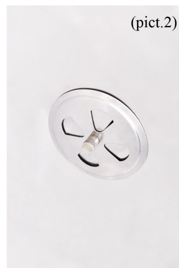
Air inlets (pict.1-2)

ATTENTION! M and SET buttons only for service technician