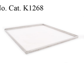
Pollen dryer drawer stainless steel frame